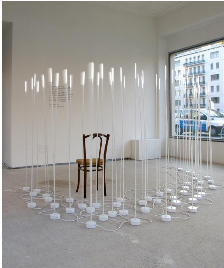
Reed - Milan 2006