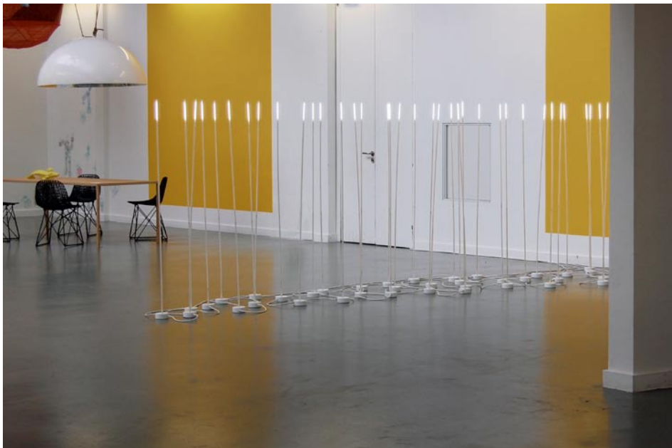
Reed - Rotterdam 2007