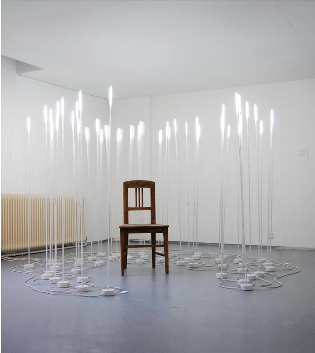
Reed - Amsterdam 2007